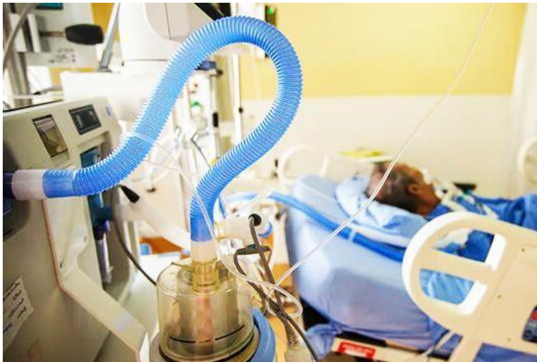
Figure 1: Mechanical Ventilation

who are receiving mechanical ventilation. In order to properly care for patients on ventilators, nurses must be educated, skilled, and confident. Mechanical ventilation has become a widespread kind of therapy.